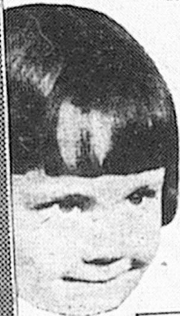
PHIL BAKER on Vitaphone!