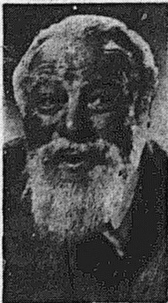
Edmund Gwenn in "Miracle on 34th Street."

If that sounds like wild enthusiasm for a picture devoid of mighty stars and presented without the usual red-velvet-carpet ballyhoo, let us happily note that it is largely because this job isn't loaded to the hubs with all the commercial gimmicks that it is such a delightful surprise. Indeed, it is in its open kidding of "commercialism" and money-grubbing plugs that lies its originality and its particularly winning charm.