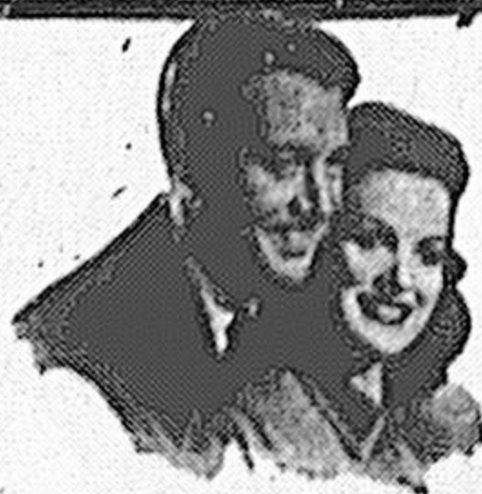
with EDMUND GWENN

That will work a Miracle in every Heart!