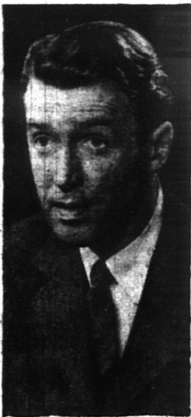
James Stewart in "It's a Wonderful Life" at the Globe.