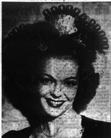
Vivian Blaine, 20th Century-Fox actress, models the "sharpest" chapeau of the season. Called "The Razor's Edge," it was designed by Ben-Ben, Chicago. Materials consist of red felt and 36 razor blades.