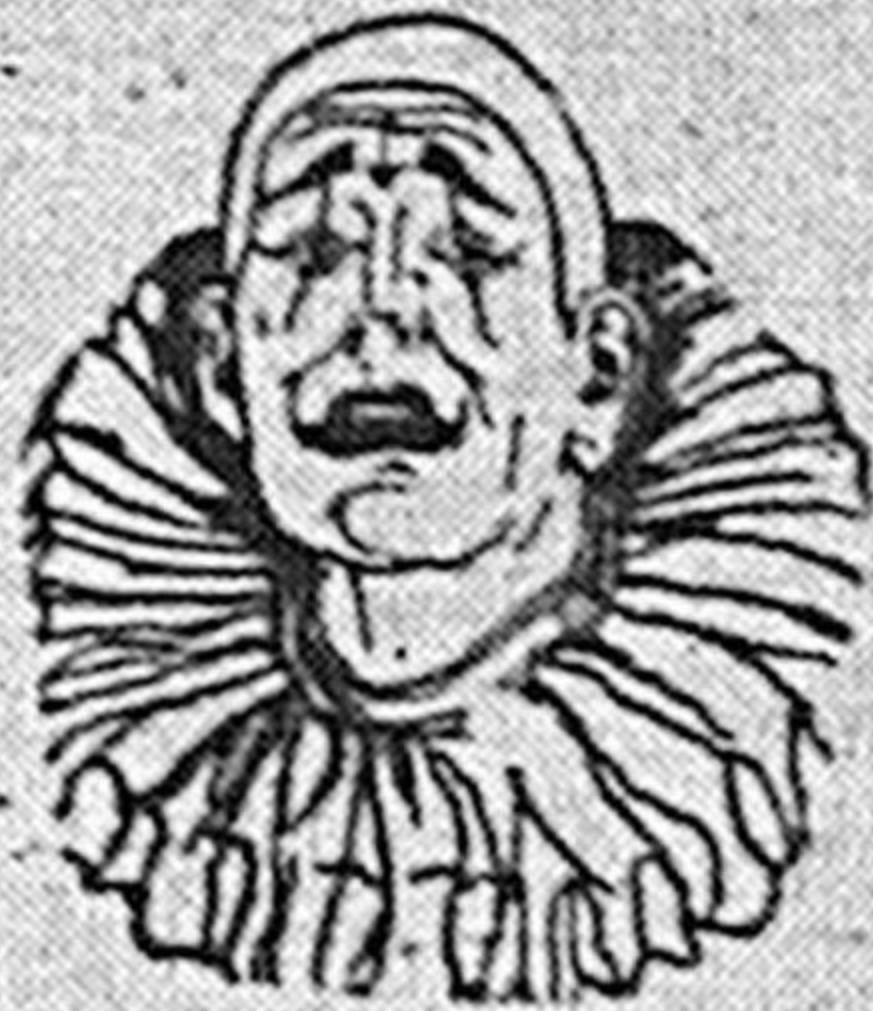
A METRO GOLDWYN PICTURE

Supported by a great cast, including NORMA SHEARER JOHN GILBERT TULLY MARSHALL