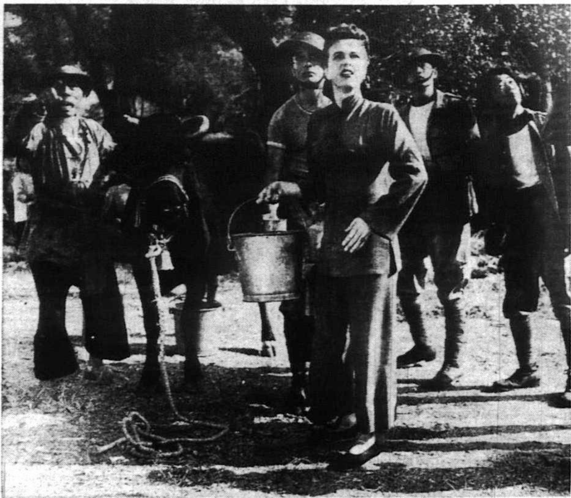
Deanna Durbin, center, and a group of frightened Chinese sight a horde of Jap bombers in "The Amazing Mrs. Holliday," new feature at the Fox.