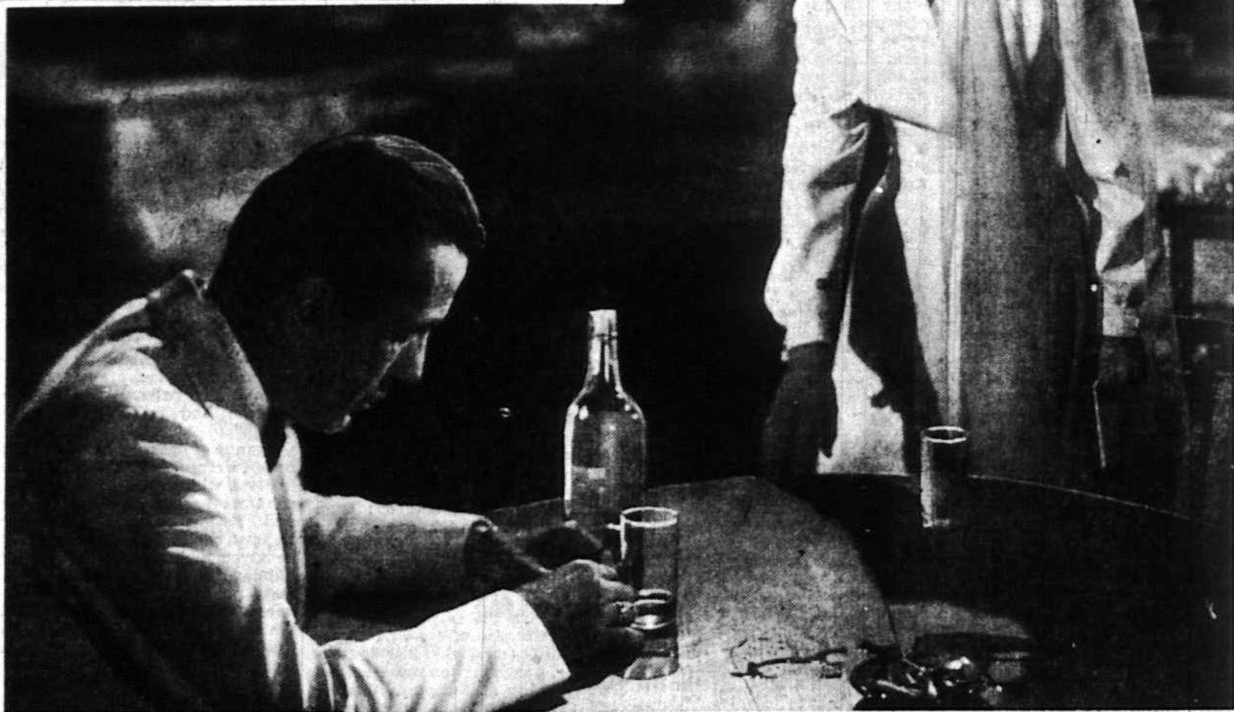
Humphrey Bogart and Ingrid Bergman in the thrilling melodrama, "Casablanca," a topical tale of adventure and romance in the spy-infested North African city, showing at the Michigan.