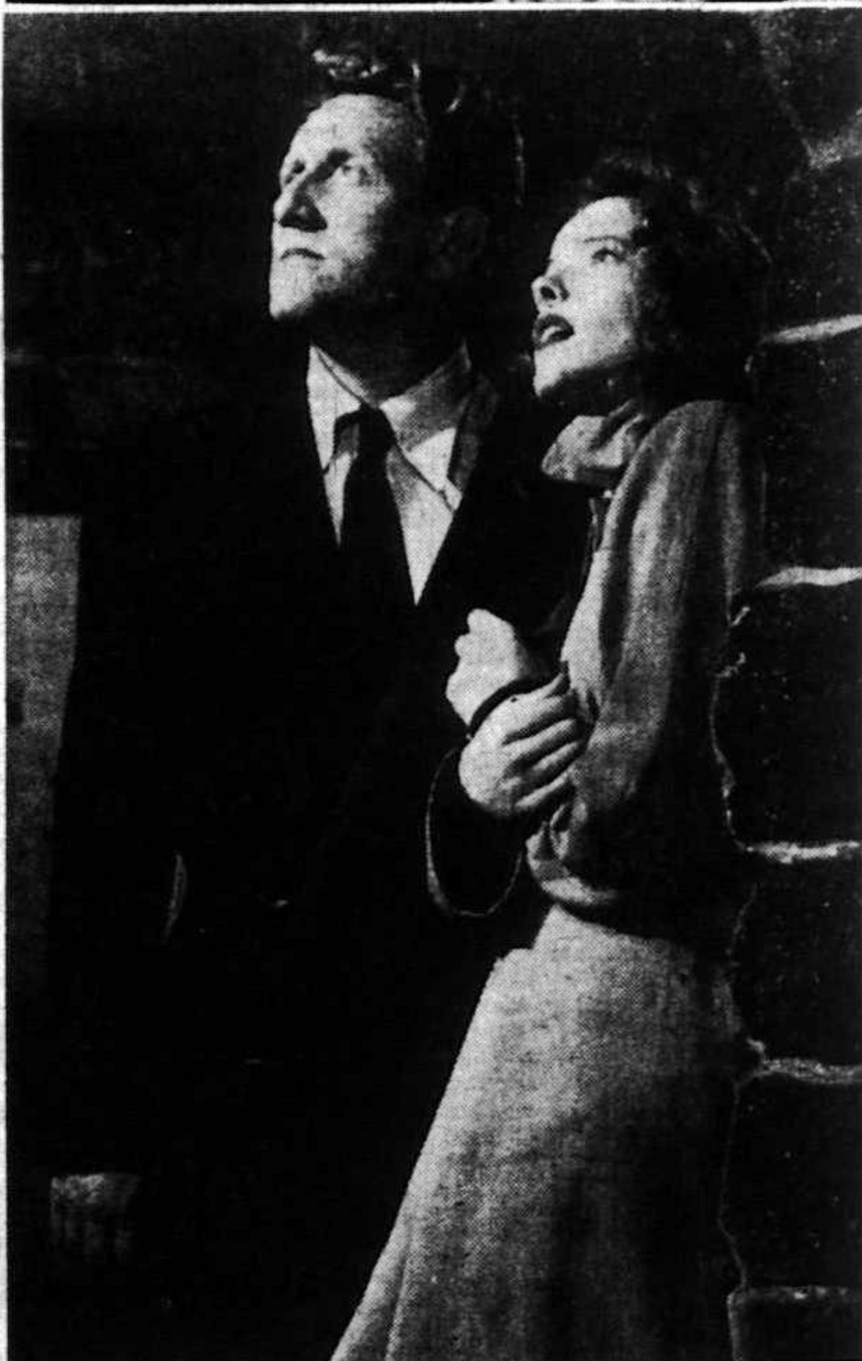
Spencer Tracy and Katharine Hepburn are arrayed against the forces of fascism in "Keeper of the Flame," continuing at the United Artists.