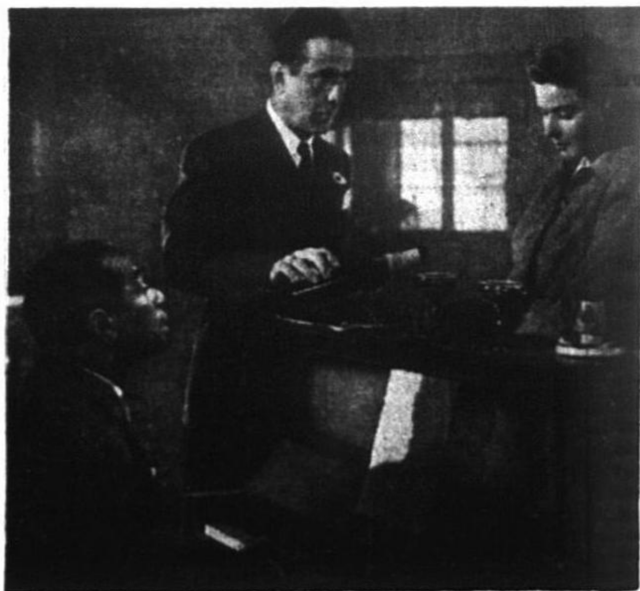
Humphrey Bogart and Ingrid Bergman in "Casablanca." The pianist is Dooley Wilson.

Yes, indeed, the Warners here have a picture which makes the spine tingle and the heart take a leap. For once more, as in recent Bogart pictures, they have turned the incisive trick of draping a tender love story within the folds of a tight topical theme. They have used Mr. Bogart's personality, so well established in other brilliant films, to inject a cold point of tough resistance to evil forces afoot in Europe today. And they have so combined sentiment, humor and pathos with taut melodrama and bristling intrigue that the result is a highly entertaining and even inspiring film.