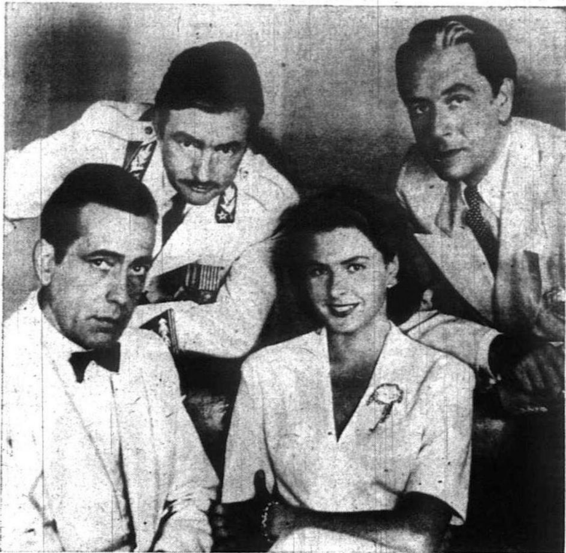
HUMPHREY BOGART, CLAUDE RAINS and PAUL HENREID cluster around lovely INGRID BERGMAN in a scene from "Casablanca," opening Friday at the Michigan with "My Heart Belongs to Daddy."